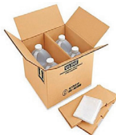
1 Gallon Industrial Rounds