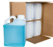
1/2 Gallon F-Style