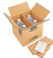
1/2 Gallon Industrial Rounds